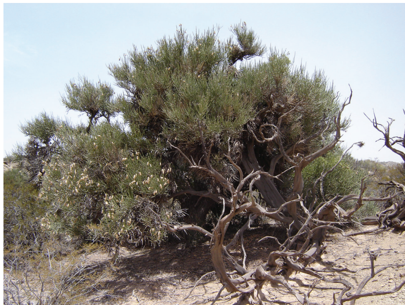
Figure 2. Individual of R. girolae in the Ischigualasto Provincial Park.

(A) Provincia de San Juan en Sudamérica, (B) Parque Provincial Ischigualasto en la provincia de San Juan y (C) sitios de muestreo (1 y 2) en el Parque Provincial Ischigualasto.