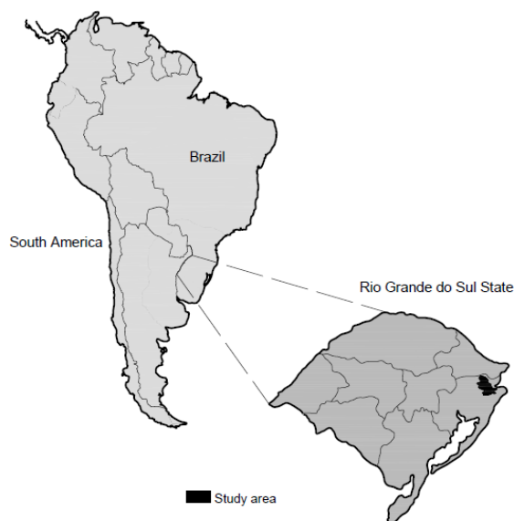
Figure 1. Geographical location of the study area in the state of Rio Grande do Sul State, Brazil.

The area of study is located in Sao Francisco de Paula, Rio Grande do Sul State, Brazil (29° 17' 56" S and 50° 34' 12" W), average altitude of 907 m (figure 1). The climate