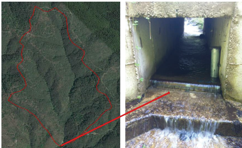
Figure 2. Box culverts at the discharge point of watersheds.

Statistical analyses. We tried to put forward the relationships between water yield and a variety of characteristics of the watersheds with the help of the multiple linear regression analysis. In these analyses, water yield is considered as a dependent variable and watershed area, circularity ratio, elongation ratio, form factor, drainage density, mean slope and elevation are considered as independent variables. To check if there is an autocorrelation among independent variables or not, Durbin-Watson test was implemented. In the regression analysis, first, the relationship between water yield and all available variables was analyzed; next, gradually, the ones presenting low-level effect were removed from the analysis.